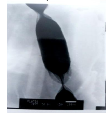
Plate 2: Photomicrographs of a 21- day old culture of Kitasatospora sp. A6 on Oatmeal agar medium (ISP-3) by transmission electron microscopy showing smooth spores.

a film on a short conidiophore (Plate 2). Aerial mycelium is often beige to brown or white to gray in some media. Ground mycelium is mostly brown to yellow. This isolate produces soluble pigments of yellow and brown color, and a brown melanin pigment produced on media ISP1,3,6 & 7 didn't change by acid or Alkali.