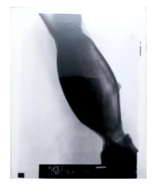
Plate 3: Photomicrographs of a 21-day old culture of Kitasatospora sp. A8 on Oatmeal agar medium (ISP-3) by transmission electron microscope showing smooth spores x 15k.

(Plate 3). The aerial mycelium is characterized by a beige gradient to reddishbrown and sometimes appears in white depending on the medium components and the degree of pH while the ground mycelium is characterized by a yellowish-brown color sometimes (Table 2). This isolate secretes brown or mostly yellow dissolved pigments as it produces yellow melanin pigment based on ISP media 1.3.6 & 7 (Table 2) and the dye color does not change using acid or alkali.